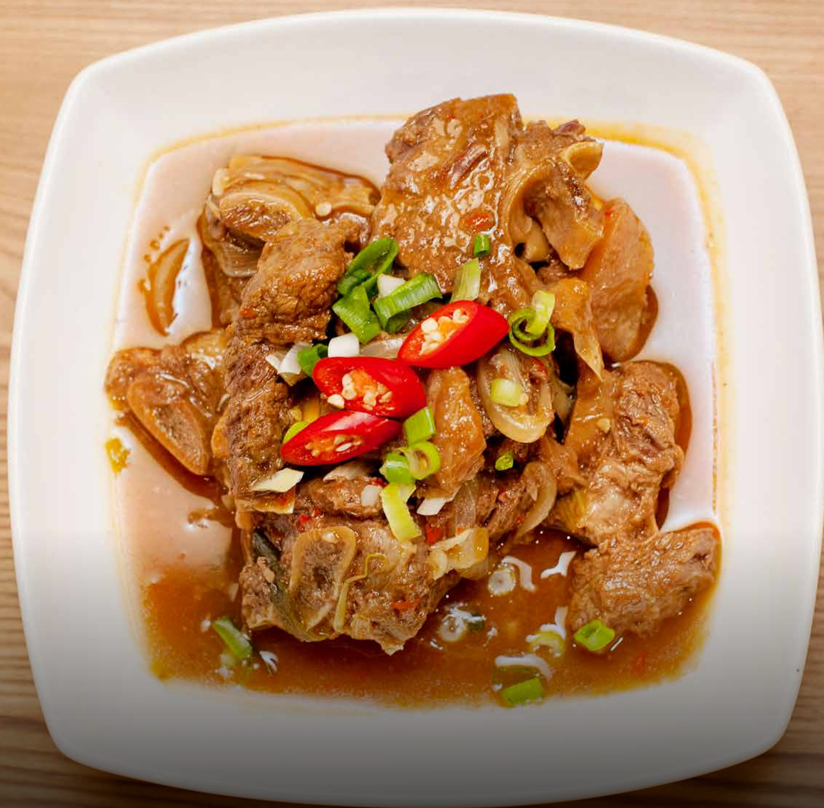
GALBI JJIM Juicy Beef short ribs, marinated for 12hrs in Hansang's signature Korean bbq sauce