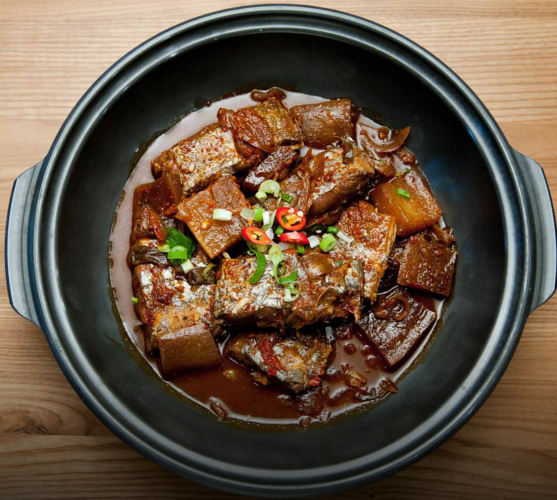
GALCHI JORIM Braised cutlassfish & radish boiled in Hansang's spicy sauce & assorted vegetables