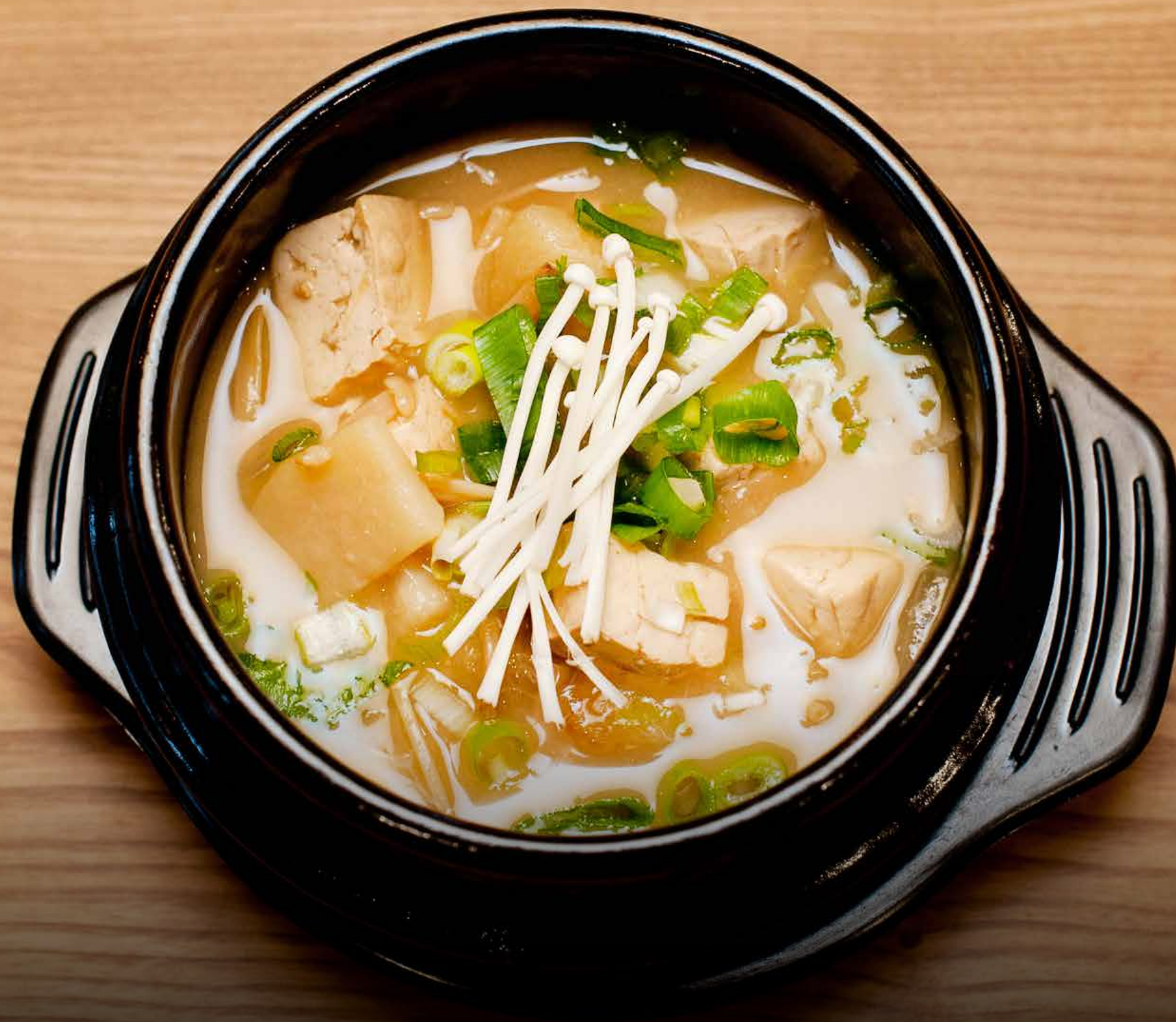
DOENJANG JJIGAE Korean traditional soybean paste soup with tofu & vegetables