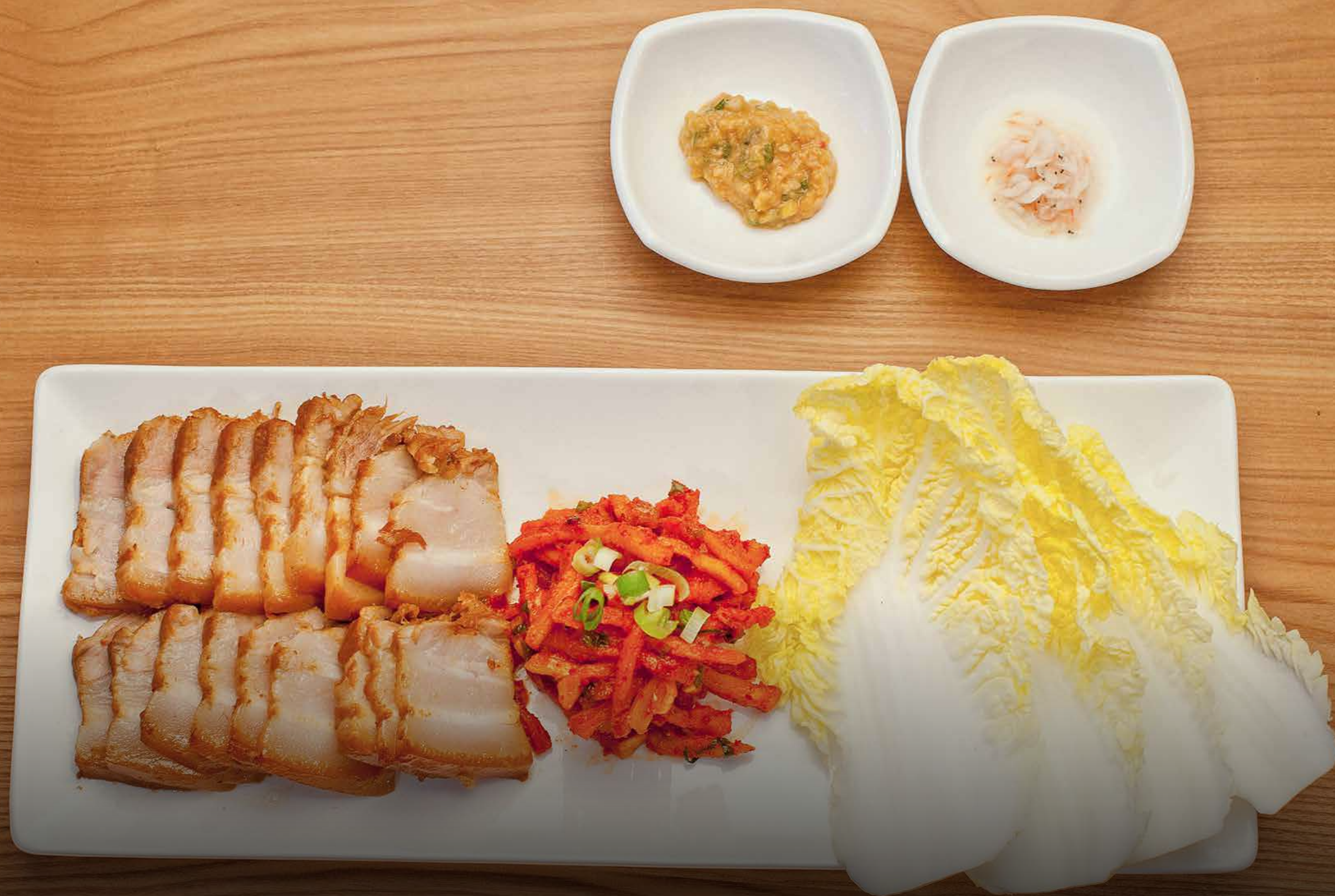
BO SSAM Tender braised pork belly boiled in a range of spices, thinly sliced & served with a side dish of Kimchi with a dipping sauce