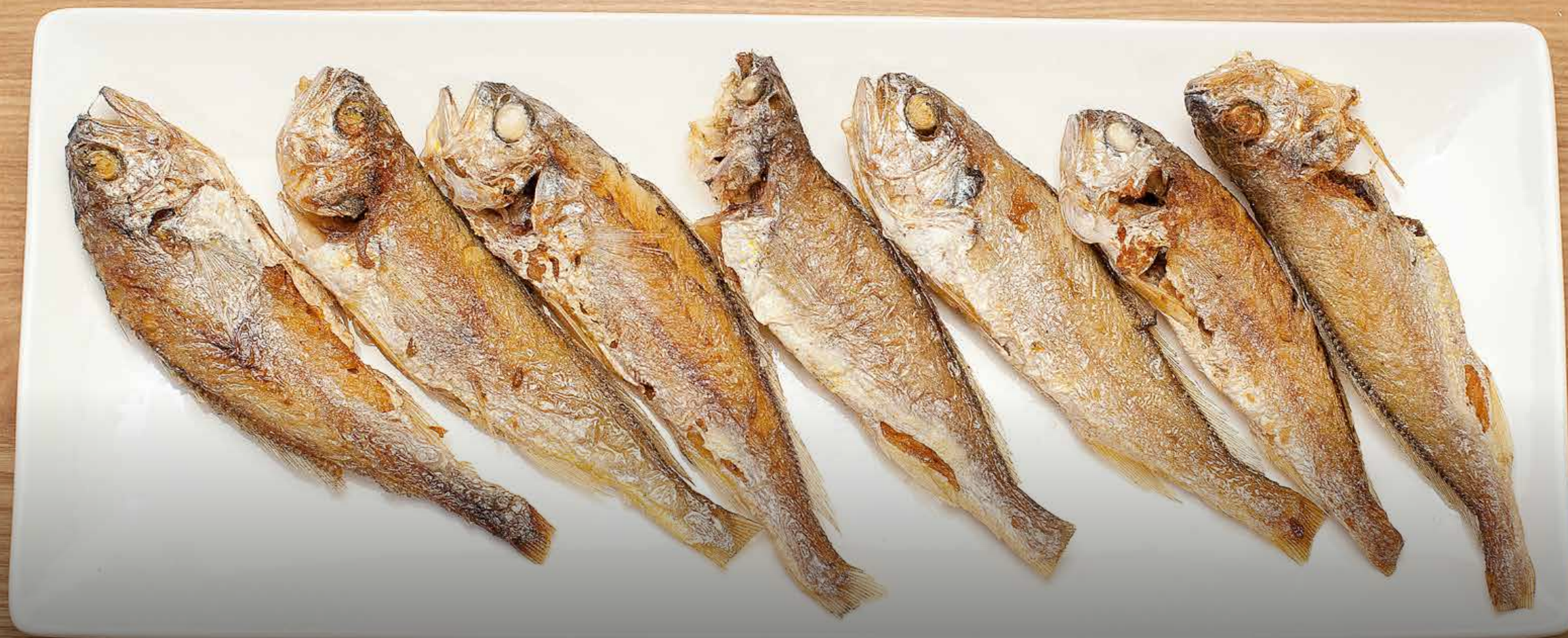
JO-GI GUI Lightly salted grilled small yellow croaker