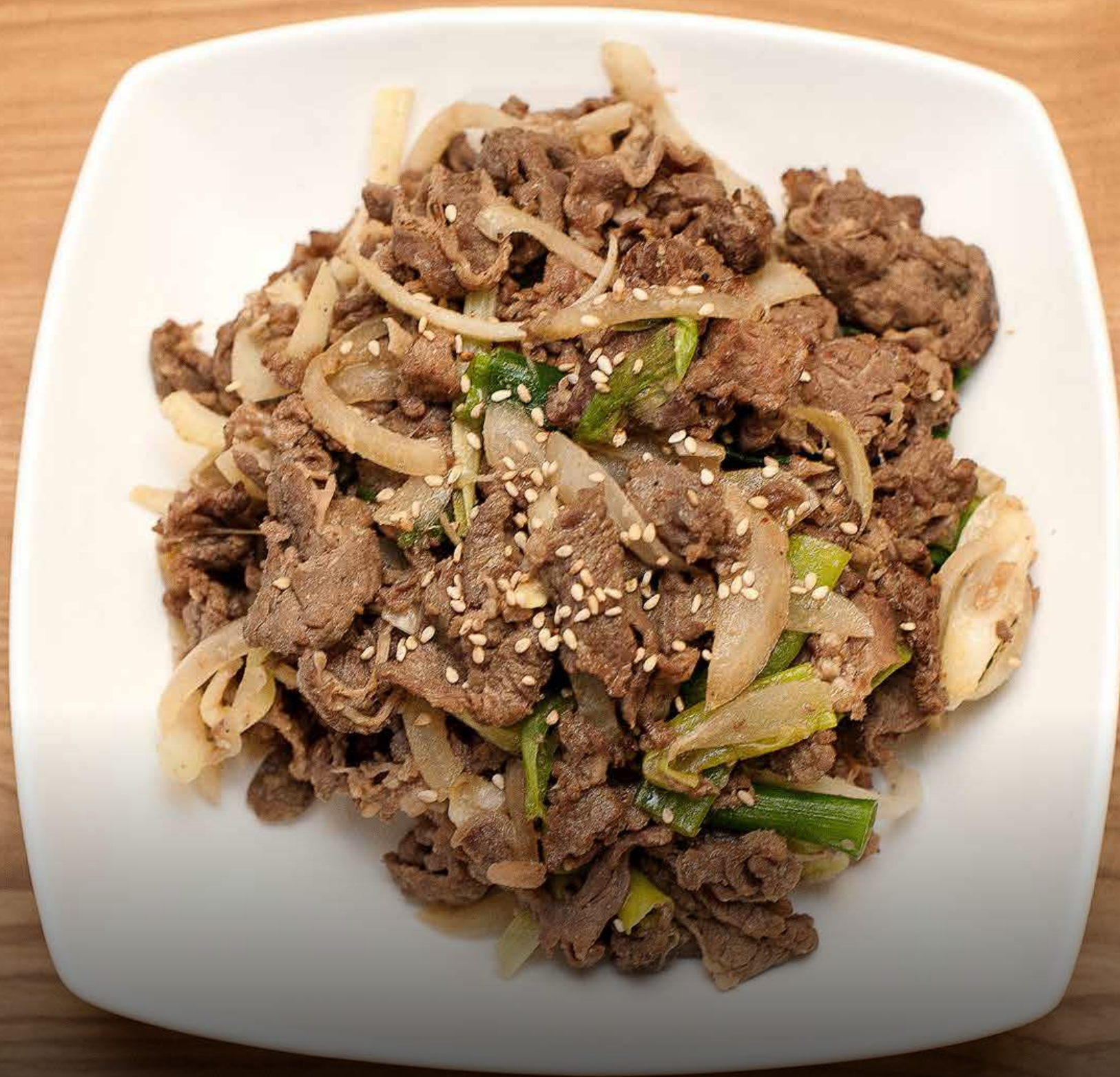
BEEF BULGOGI Savoury Prime beef thinly sliced & marinated in sesame oil, garlic, ginger & soysauce for 4hrs to enhance the flavours