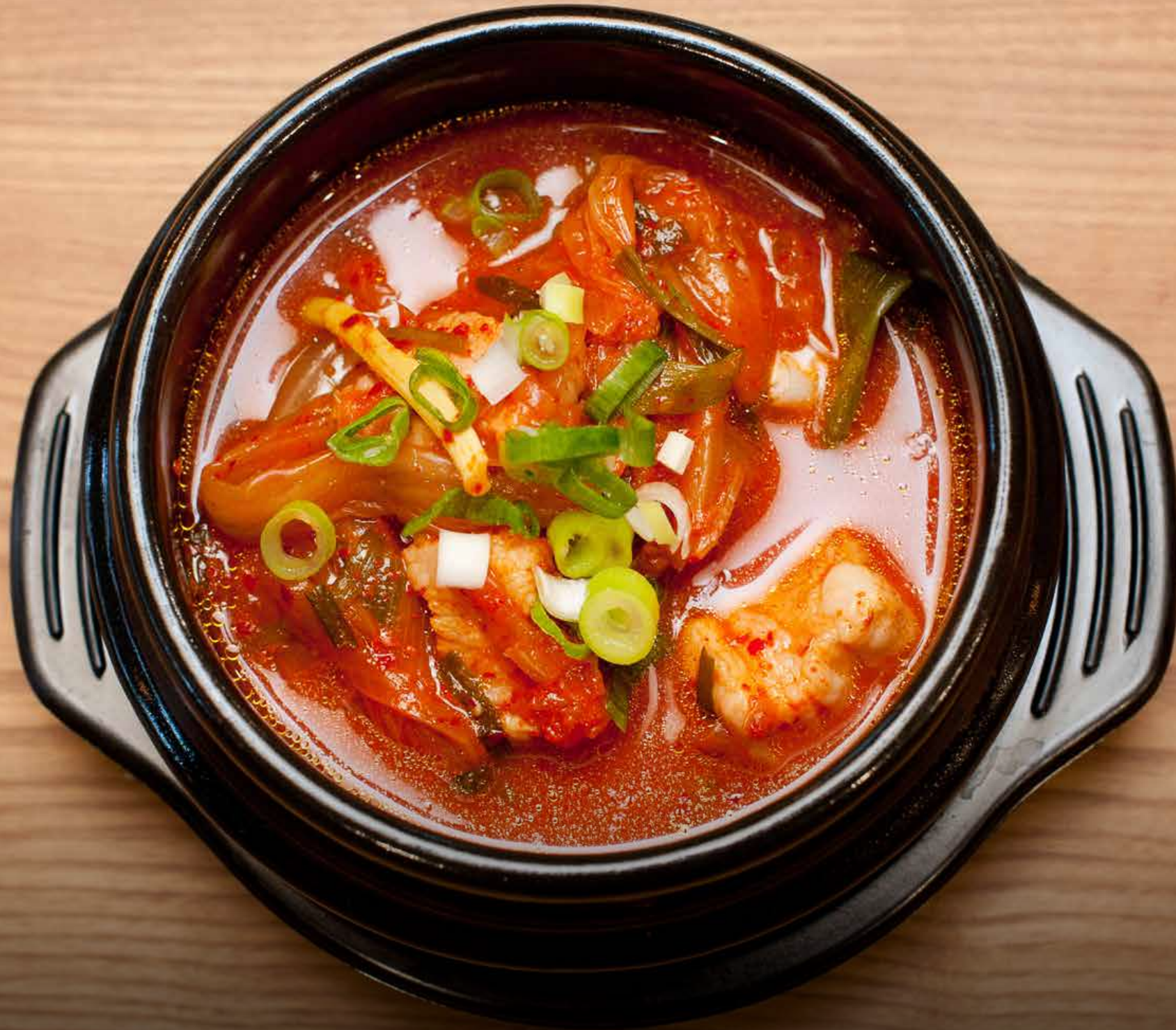
KIMCHI JJIGAE Warm spicy kimchi stew with sliced pork & vegetables