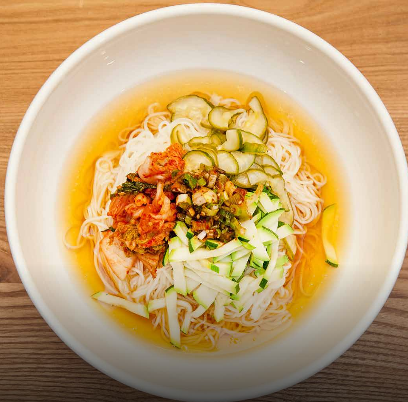
JANCHI GUKSU Thin wheat noodle boiled & served in Hansang's signature soup with a variety of thinly sliced vegetables