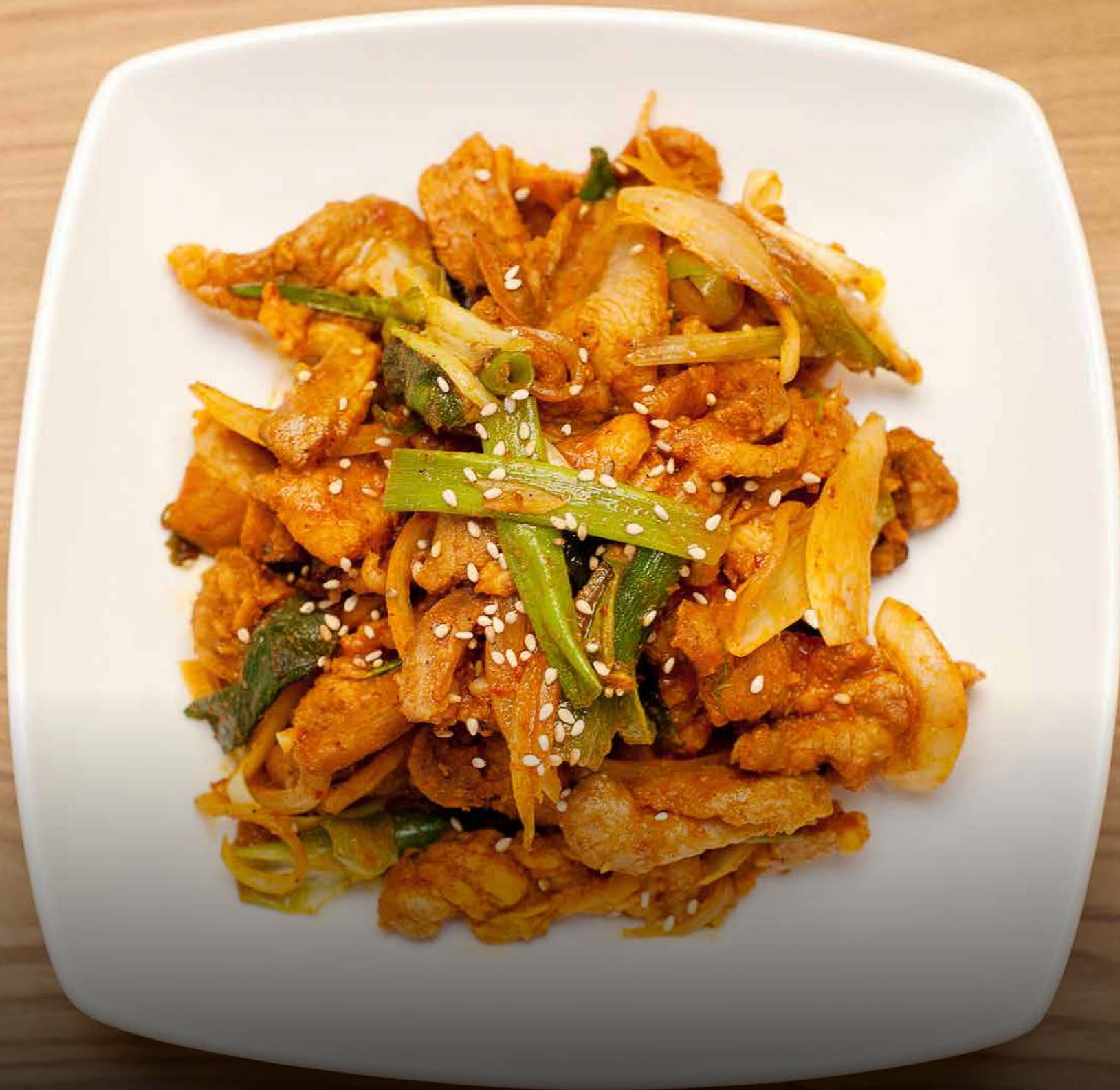
SPICY PORK BULGOGI Tender pork thinly sliced & marinated in Hansang's spicy sauce