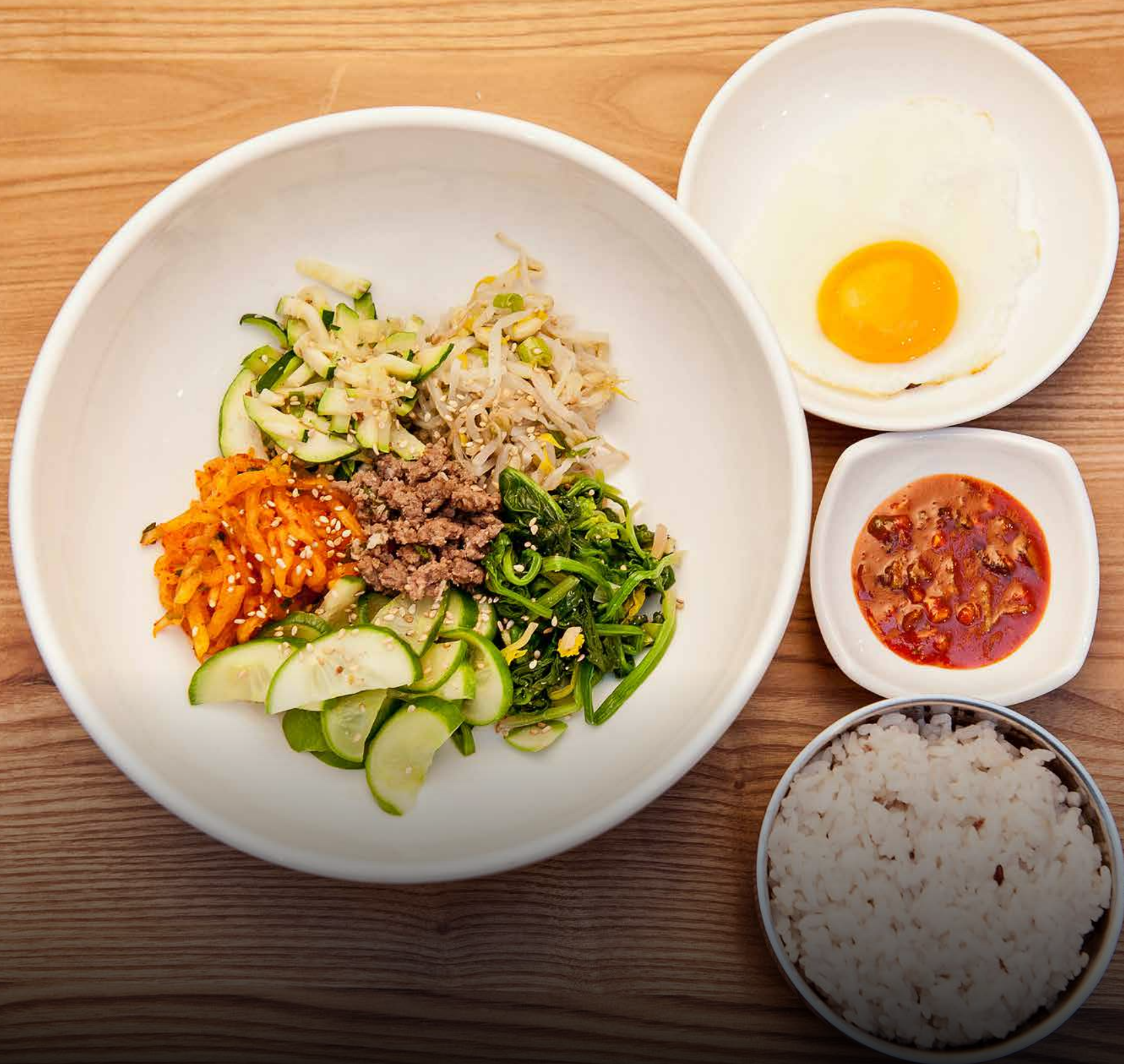
BIBIMBAB Hot rice topped with variety of cooked vegetables, marinated beef, layered with a fried egg on top